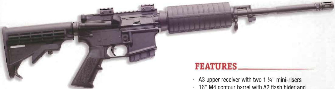
Bullet Button M4 Type ORC (90888)