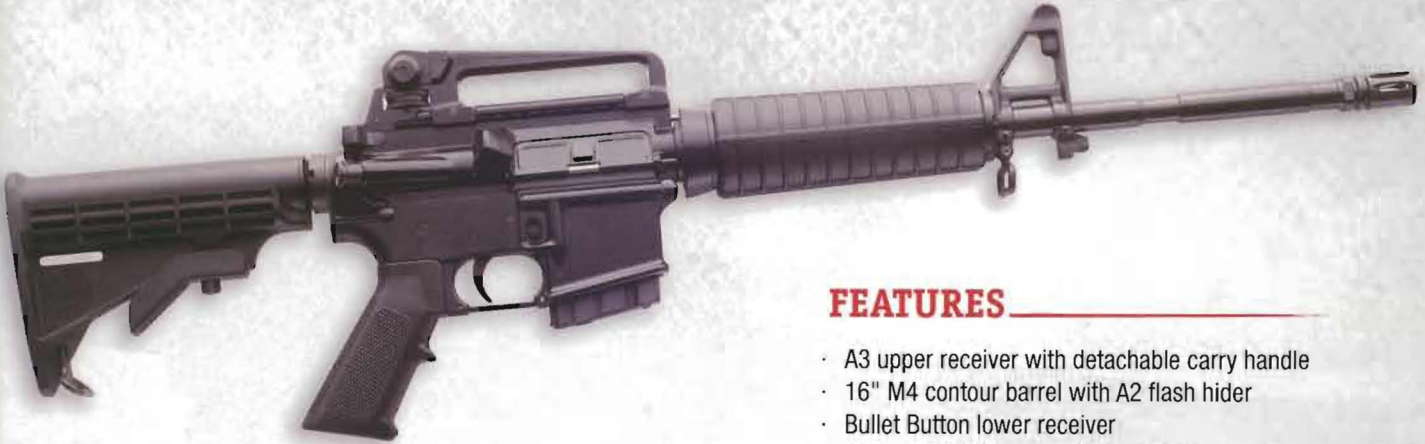
Bullet Button Patrolman's Carbine (90880)