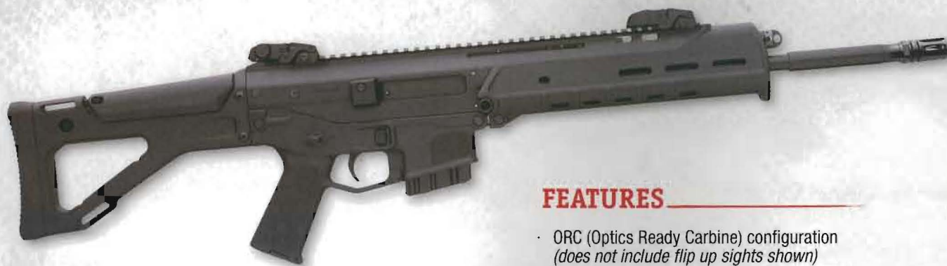
Bullet Button ORC ACR® (90893)