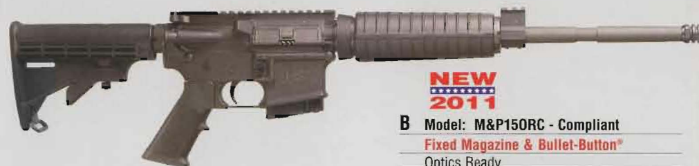
NEW 2011 B Model: M&P15ORC - Compliant Fixed Magazine & Bullet-Button* Optics Ready Product: 151009 - 16" Barrel 5.56 mm NATO - 10 Rounds Compliant For Sale in CA*