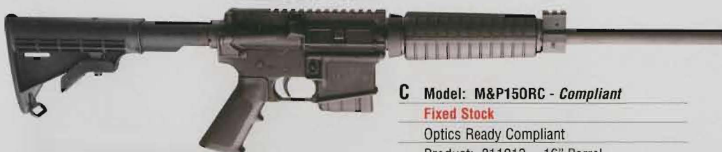
C Model: M&P15ORC - Compliant Fixed Stock Optics Ready Compliant Product: 811013 - 16" Barrel 5.56 mm NATO - 10 Rounds Compliant For Sale in CT, MA, MD, NJ, NY* *Compliance subject to change. Please check with your local dealer

*Compliance subject to change. Please check with your local dealer