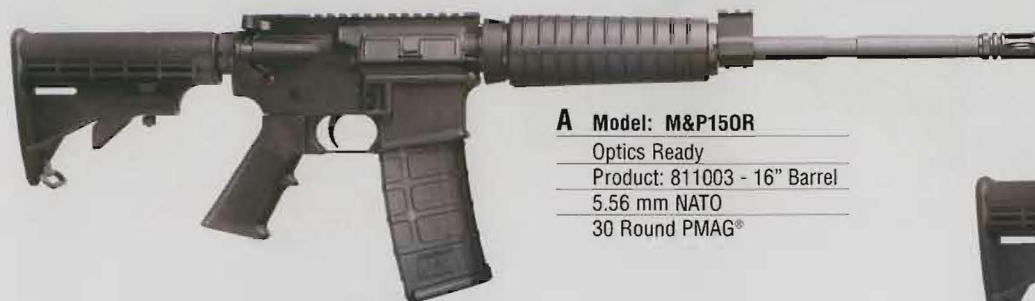
A Model: M&P15OR Optics Ready Product: 811003 - 16" Barrel 5.56 mm NATO 30 Round PMAG®

The M&P15 rifle line is Smith & Wesson's version of the popular semi-automatic AR-15 rifle. These rugged, lightweight rifles are built to perform flawlessly under varied conditions.